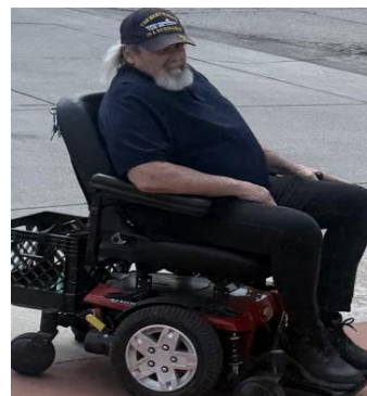
Unknown Male (can ride 10/15/26)