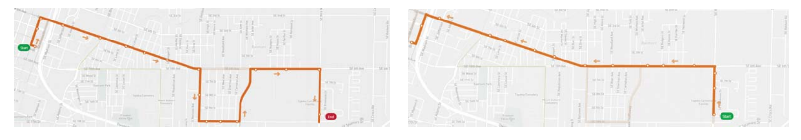
Alternating every 30 minutes with