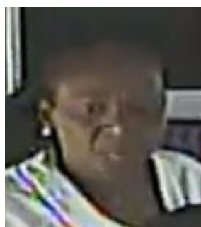
Unidentified Female (can ride 3/15/26)