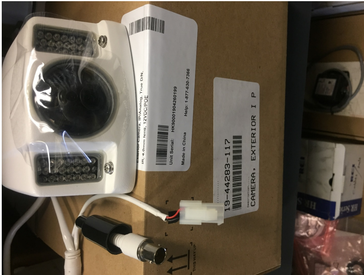
Topeka Metro Q6. A6. Exterior Camera No Adapter Needed