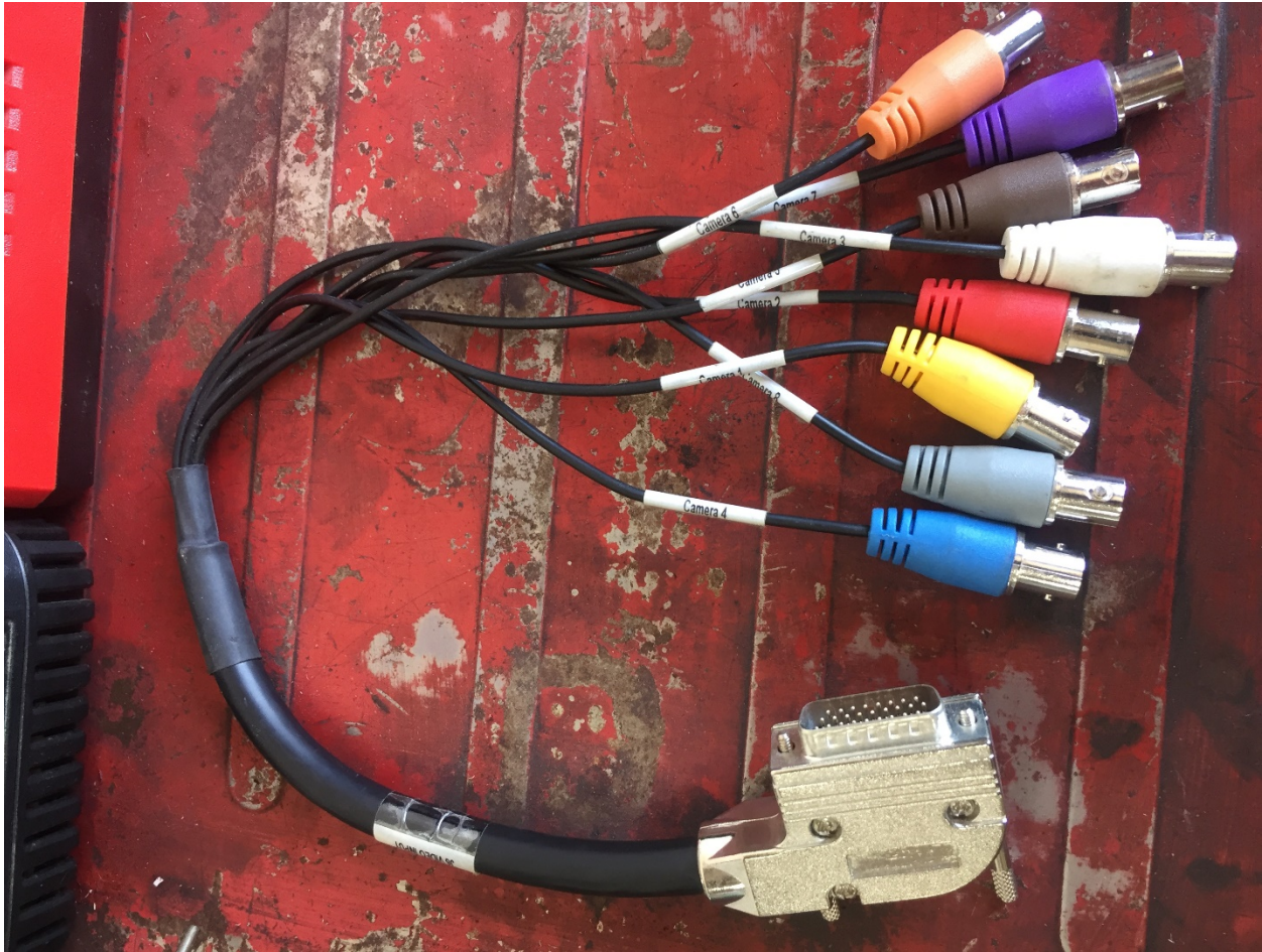
Topeka Metro Q6. A6. Video Cables