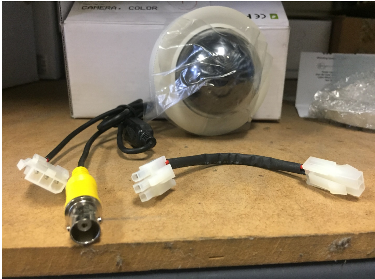
Topeka Metro Q6. A6. Interior Camera with Adapter